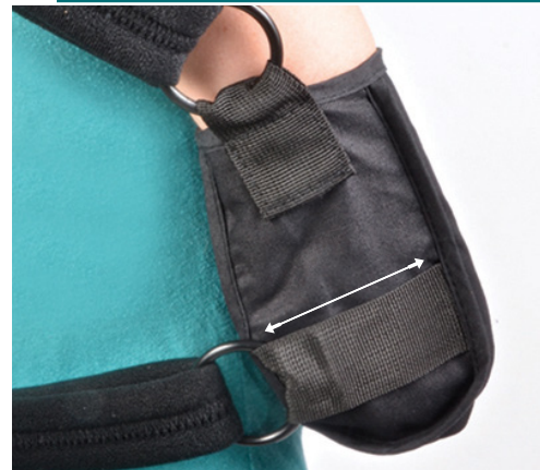
POSTERIOR GUSSET AND IMMOBILIZATION STRAP ON O-RING TRAVELER PROVIDES OPTIMAL FIT